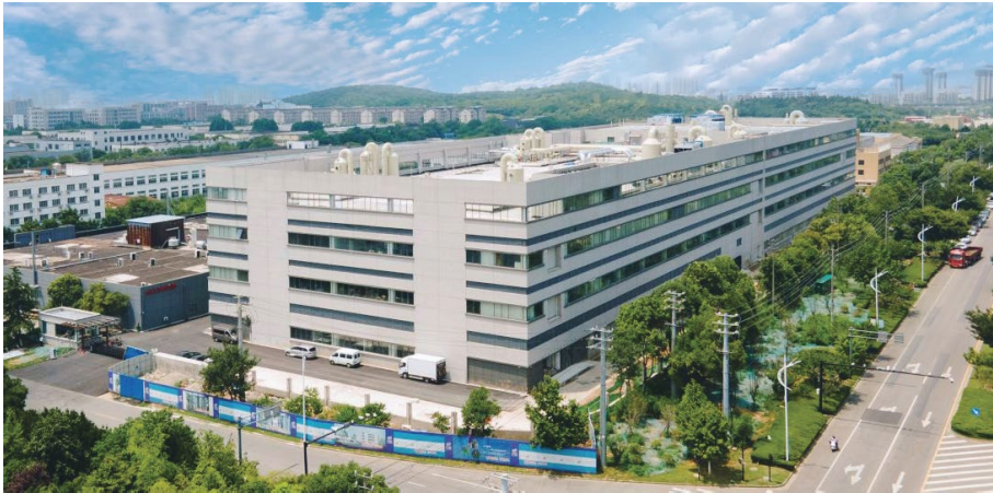
The HDI capable factory opened August 4 th , 2022.